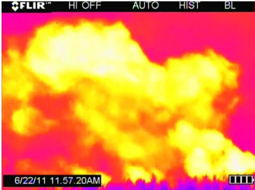
Figure 1. Venting of natural gas into the atmosphere at the time of well completion and flowback following hydraulic fracturing of a well in Susquehanna County, PA, on June 22, 2011. Note that this gas is being vented, not flared or burned, and the color of the image is to enhance the IR image of this methane-tuned FLIR imagery. The full video of this event is available at http://www.psehealthyenergy.org/resources/view/198782 .